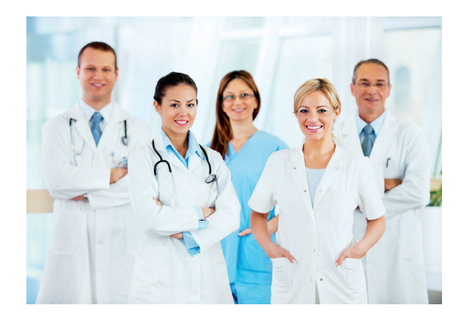
Your Feedback enables us to improve our service to you and others in the future.

Even if you were entirely satisfied with your stay, please let us know, as we equally embrace compliments to further develop and motivate our staff professionals and systems.